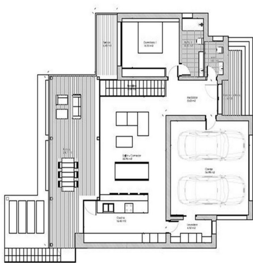
Planta 1ª planta 883m 2 (SSE)